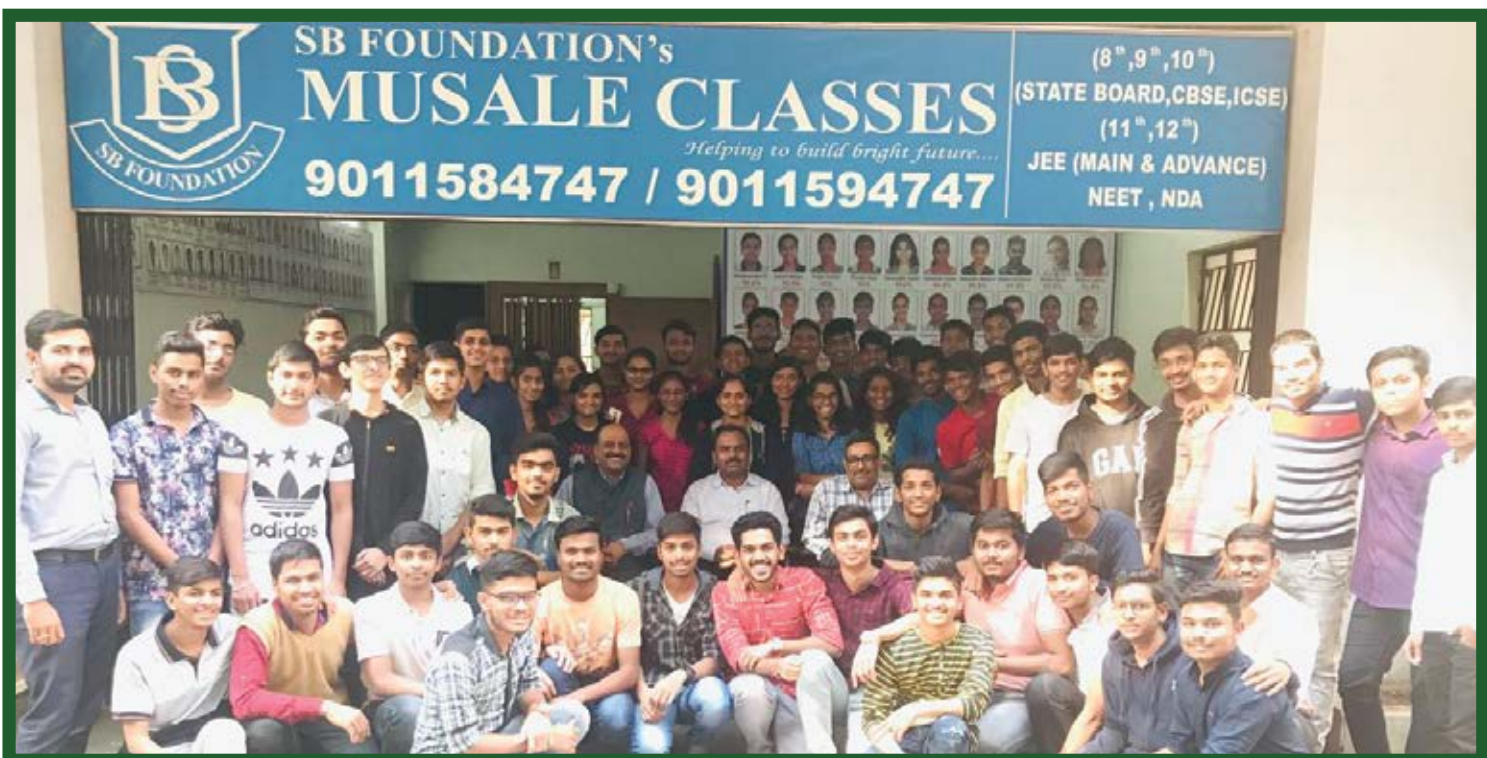
A home... away from home (Aundh Hostel)