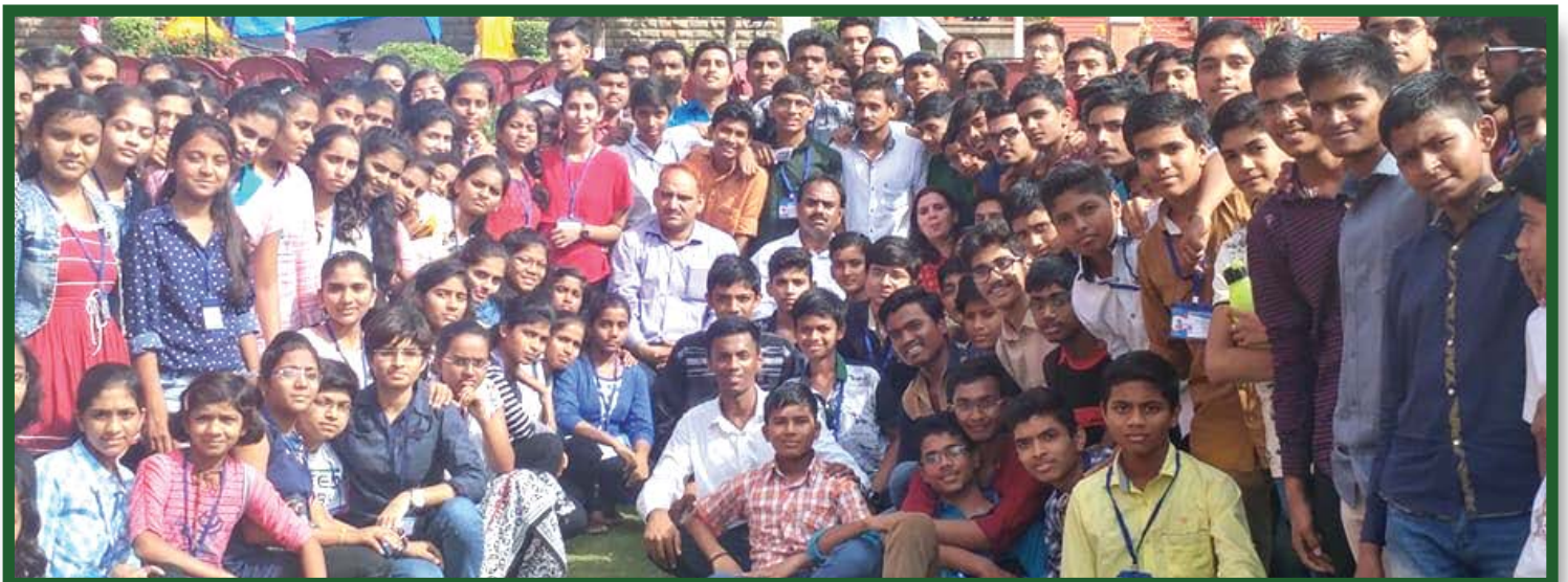
Inspirational trip to NDA, Pune