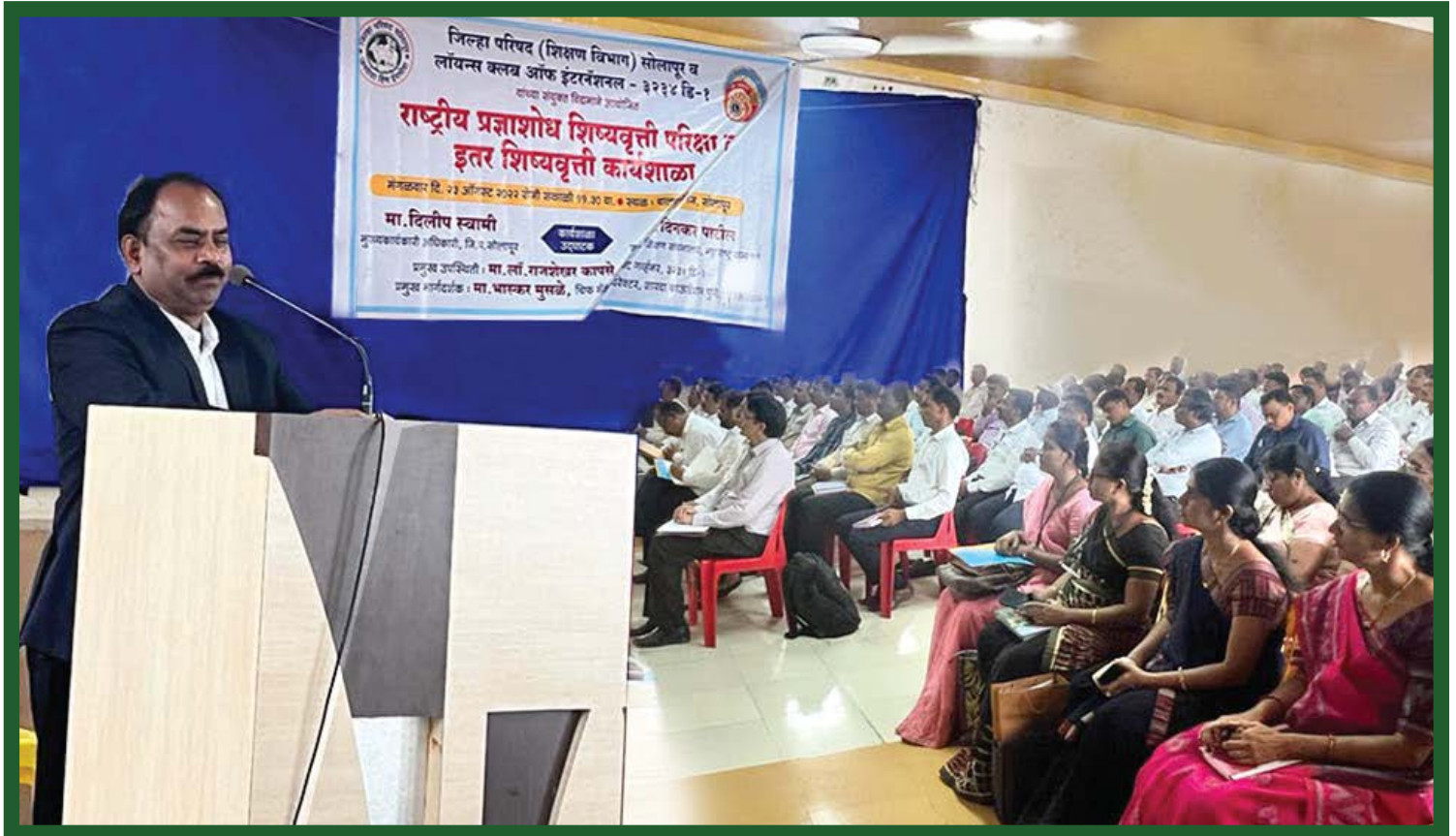
NTSC / Olympiads Workshop for Solapur District Principals.