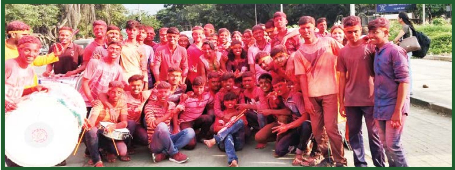
Ganpati Bappa.... Visarjan (Aundh Hostel)