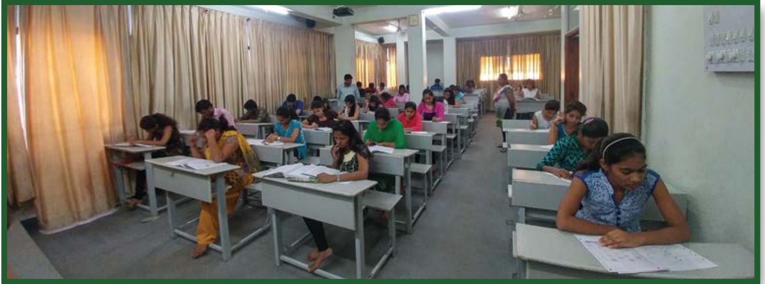
Classroom (Aundh Branch)