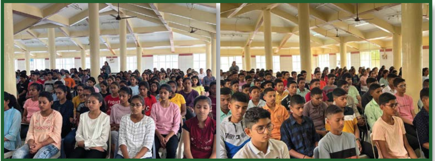
Meditation Session by Musale Sir